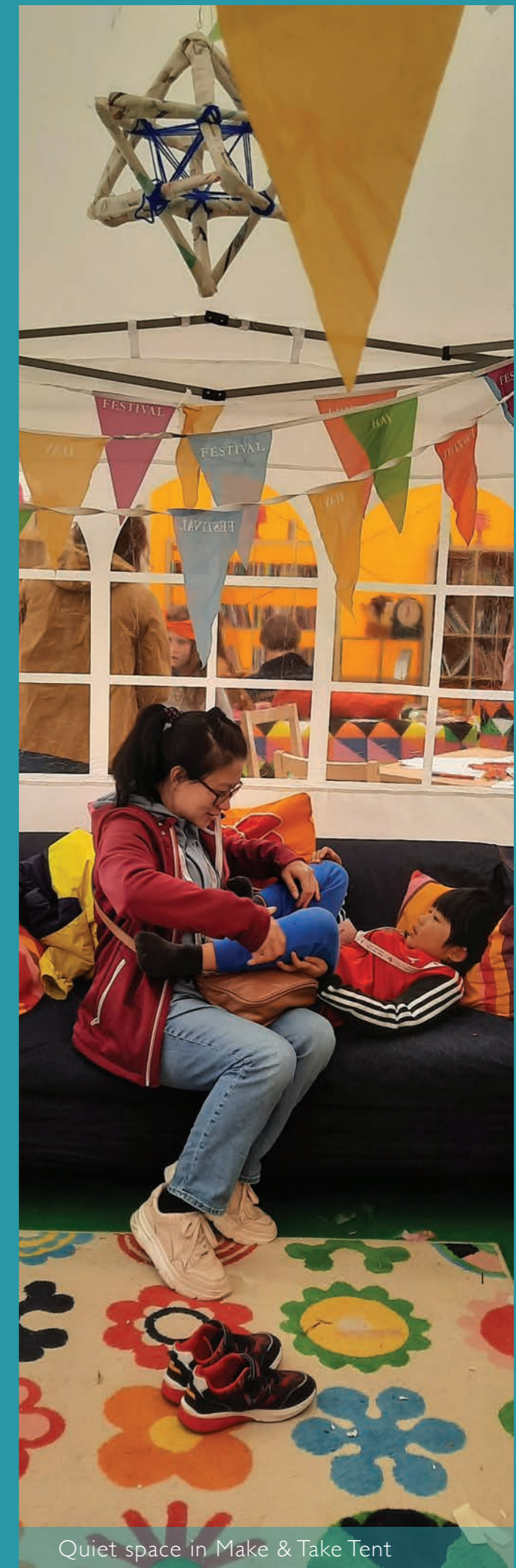
Quiet space in Make & Take Tent

5pm Return travel – coach waiting at main entrance by 5.15pm