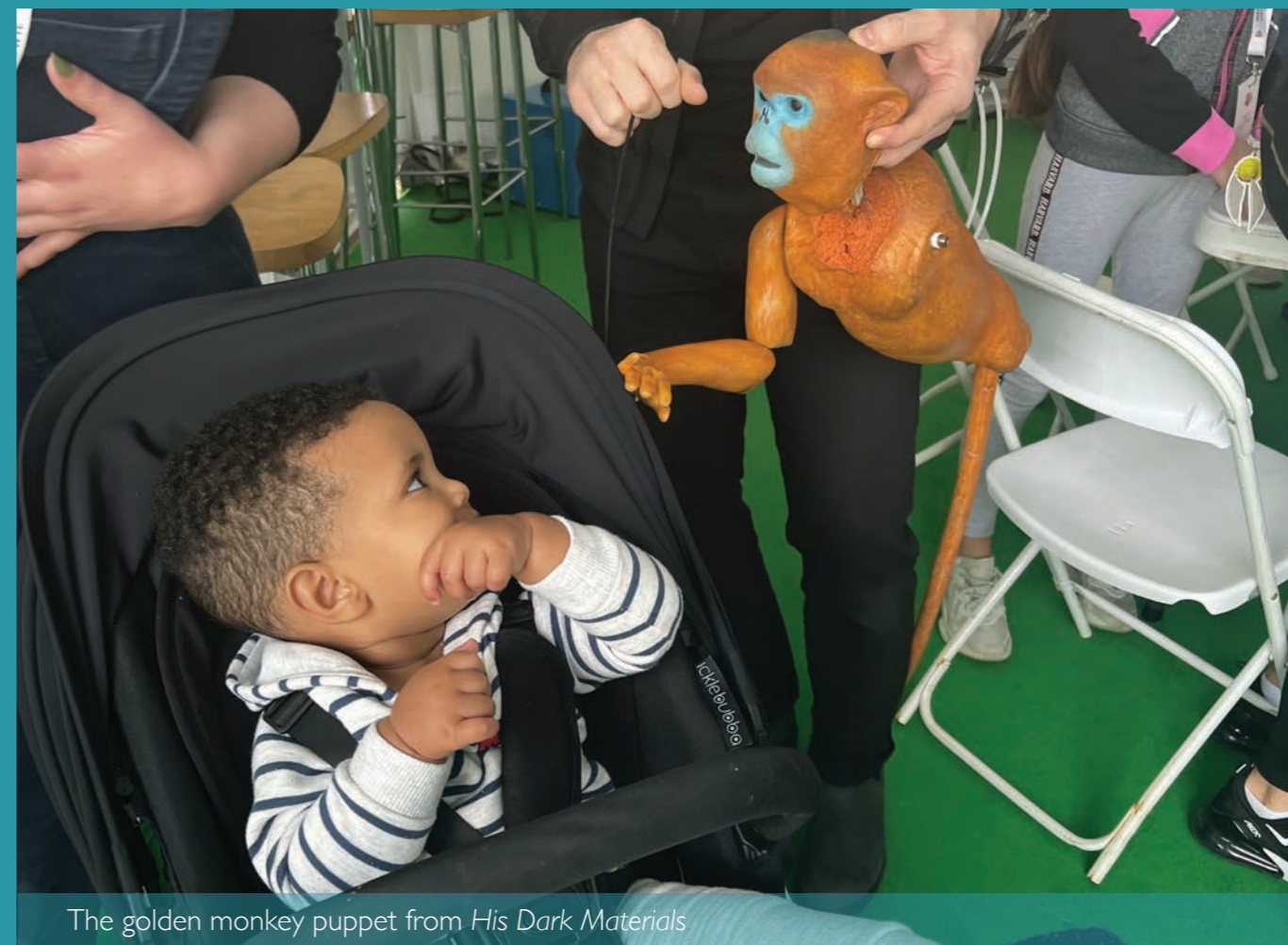
The golden monkey puppet from His Dark Materials