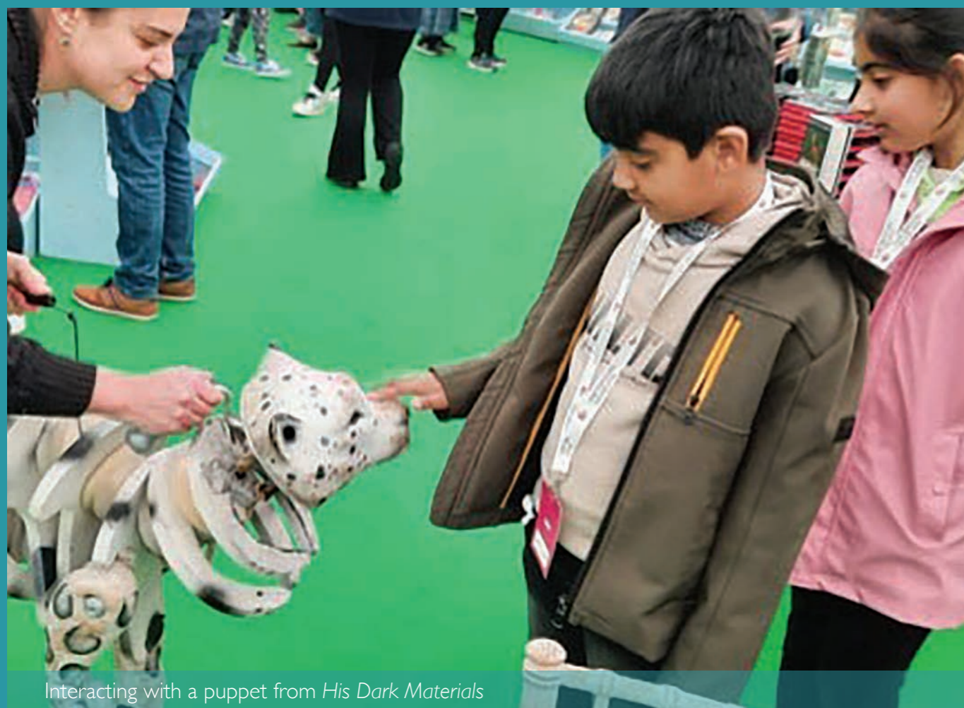
Interacting with a puppet from His Dark Materials