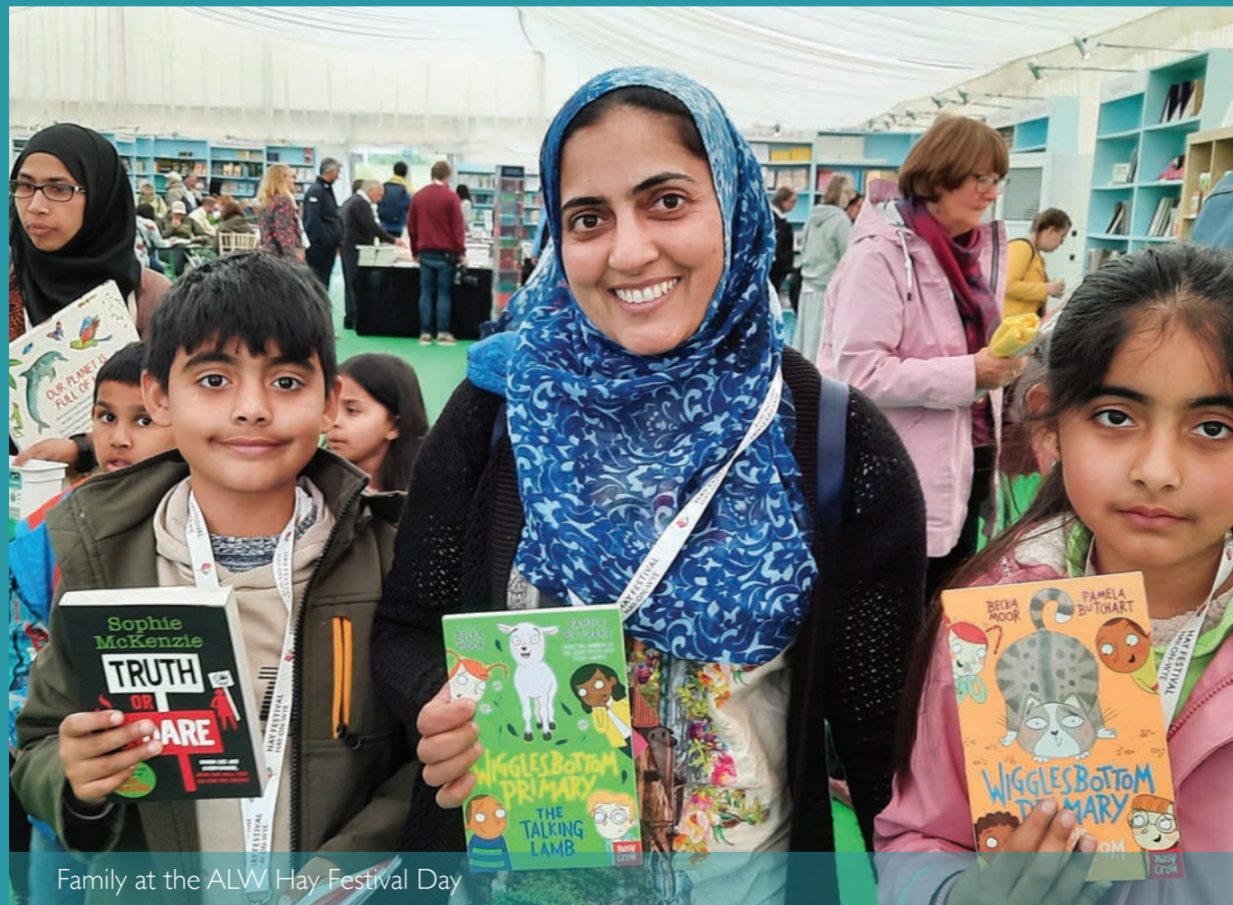
Family at the ALW Hay Festival Day