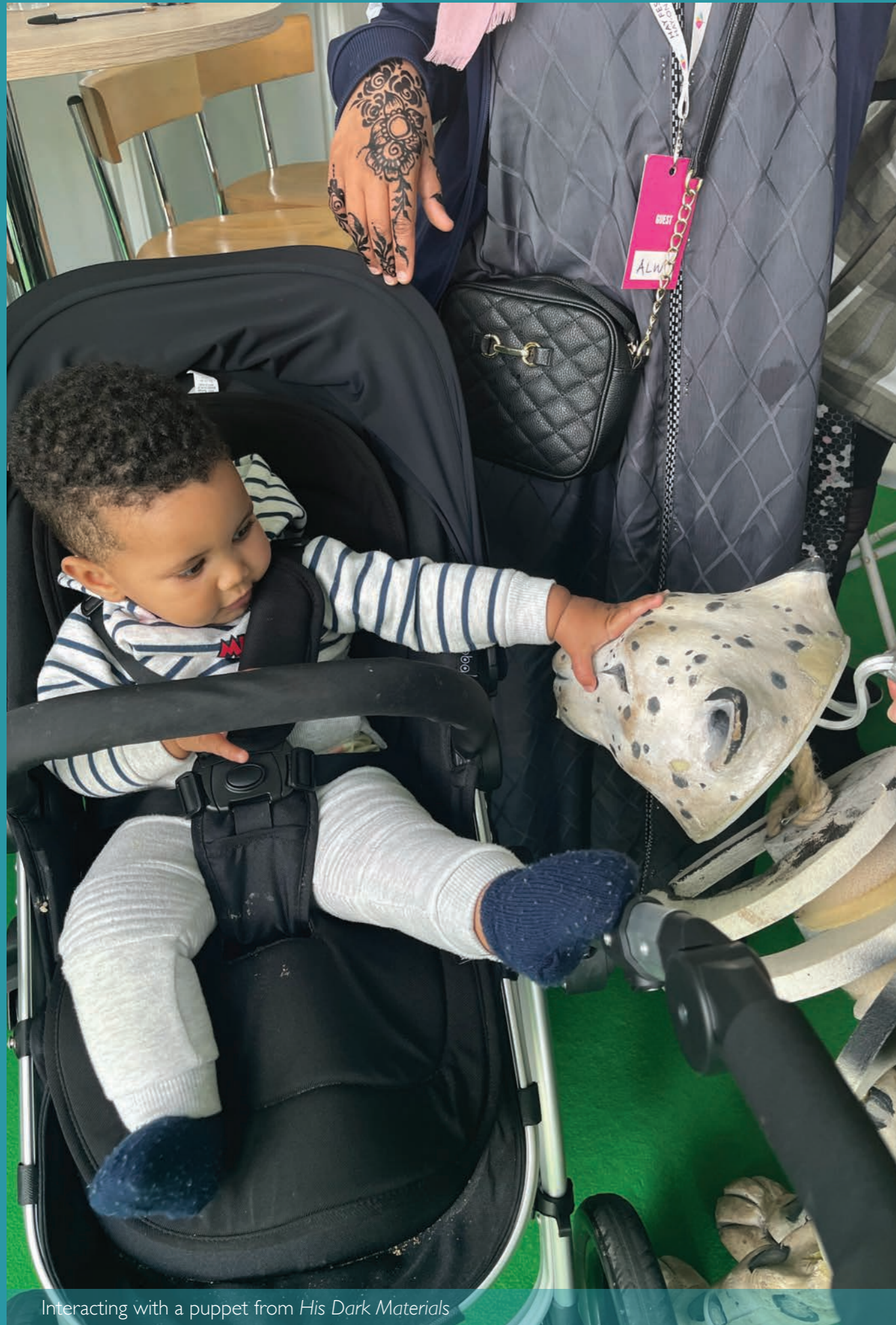
Interacting with a puppet from His Dark Materials