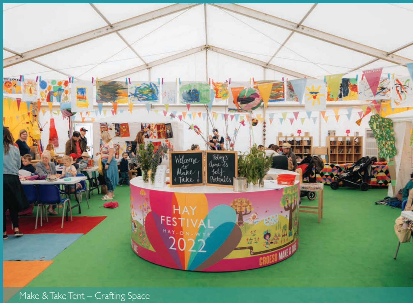
Make & Take Tent – Crafting Space