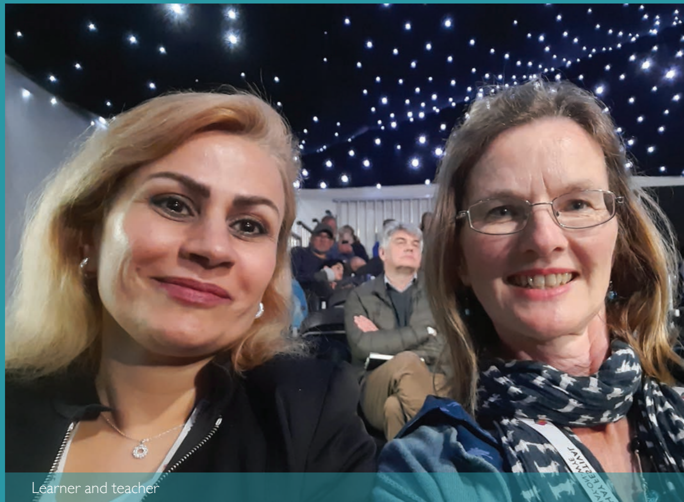
Learner and teacher