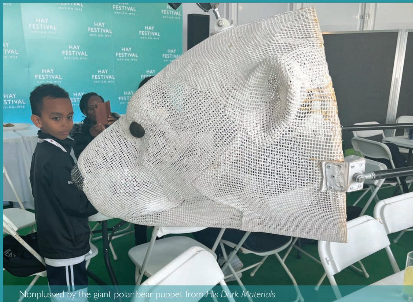
Nonplussed by the giant polar bear puppet from His Dark Materials