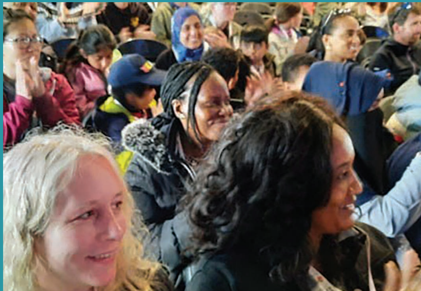
Learners and teachers watching an event