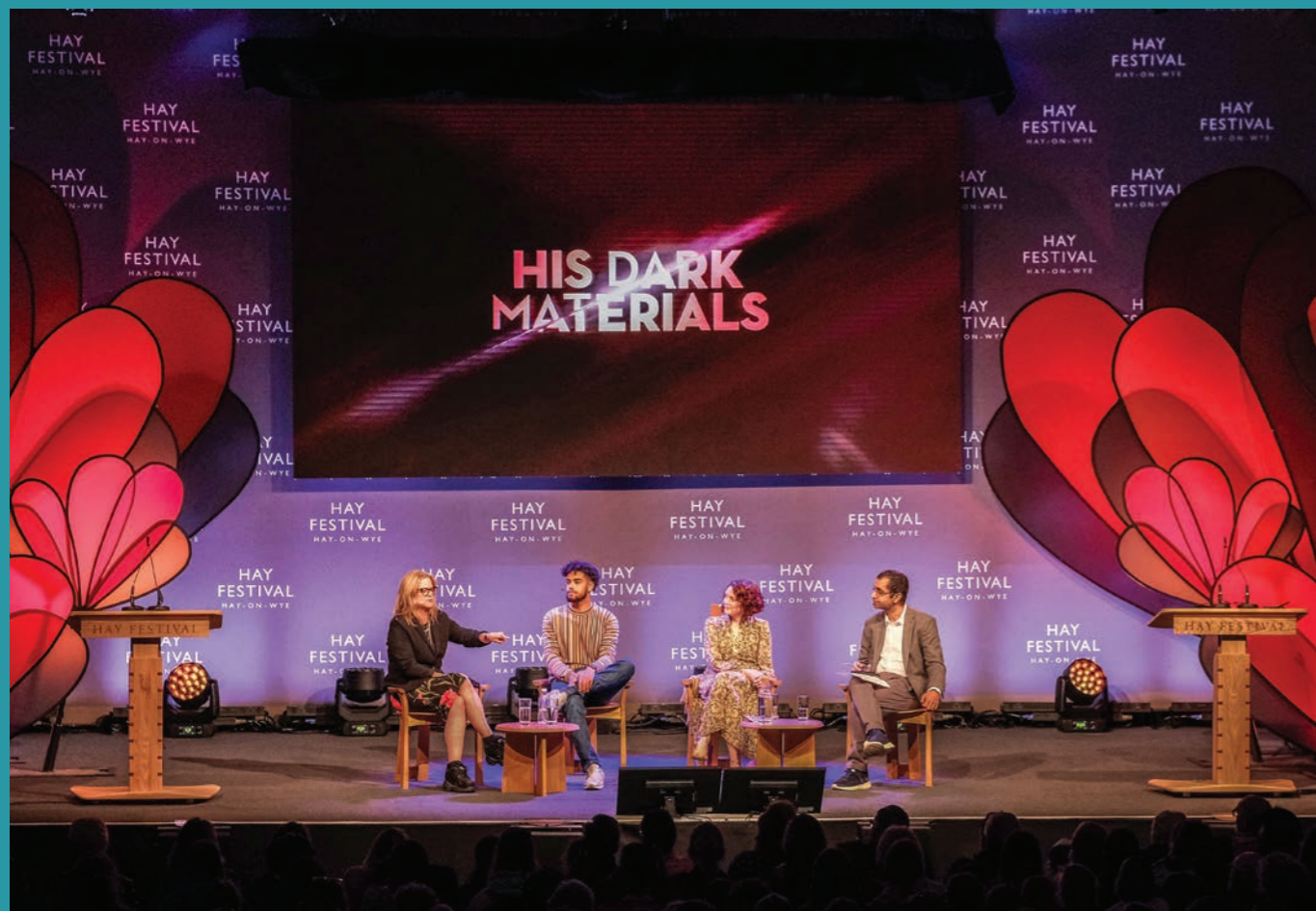
Bad Wolf event about His Dark Materials